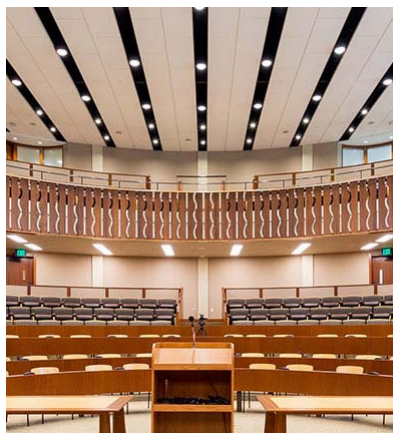
GNHCC Legislative Breakfast