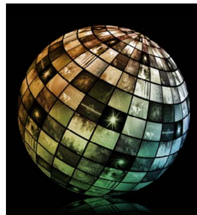
March 7 CERC's Statewide Economic Development Quarterly Meeting