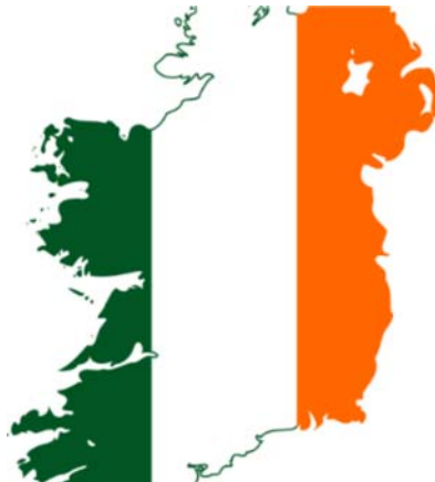
Visit New Haven/REX representing Greater New Haven on US Dept. of Commerce Trade Mission to Ireland & England