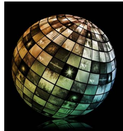
September 12 CERC's Statewide Economic Development Quarterly Meeting