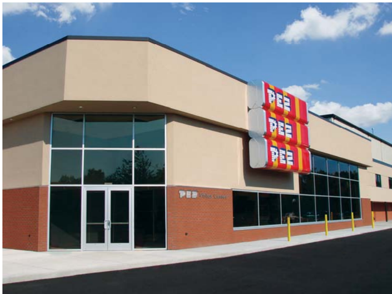
PEZ Candy of Orange, interviewed on WLIS/WMRD regarding food manufacturing in the region.

10/8 GNHCC Governmental Affairs Committee agreed on an abbreviated Regional Legislative Agenda regarding hospital costs and taxes, increased training for manufacturing jobs and modernization of Tweed New Haven Regional Airport. Legislative Breakfast is tentatively scheduled for the third week of January.