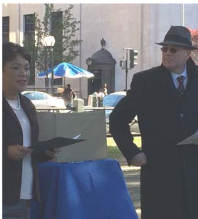
Regional Water Authority Day Proclamation

For presentations, visit http://www.rexdevelopment.com/index.php/what-we-do/programs/communicate