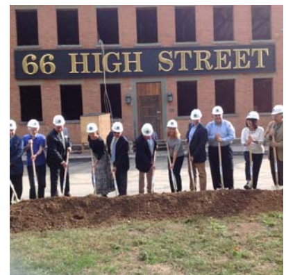
Ribbon-cutting at 66 High Street, Guilford—Groundbreaking for new construction that will transform a factory to condos.