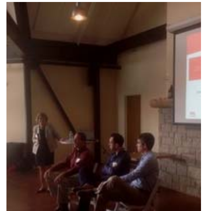
Panel Discussion with open Q&A: Meet the Movers & Shakers

For presentations, visit http://www.rexdevelopment.com/index.php/what-we-do/programs/communicate