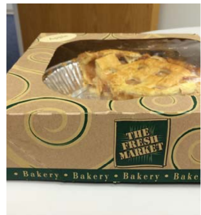
Opening of Fresh Market, Guilford