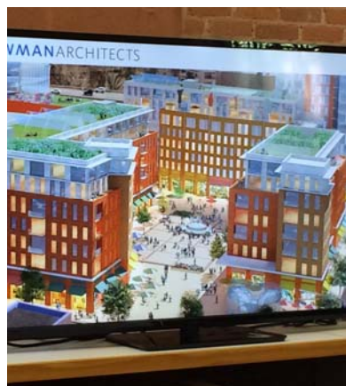
LWLP Site Developer Announcement: Newman Architects