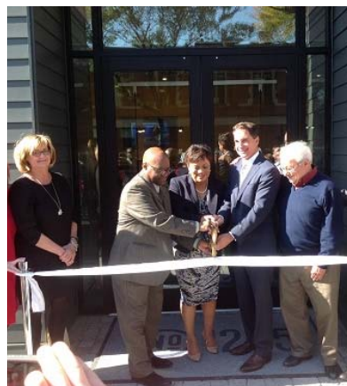
Ribbon-cutting at The Novella, New Haven