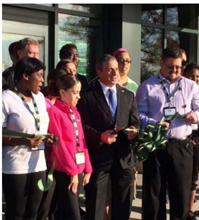
Ribbon-cutting at Dick's Sporting Goods, North Haven