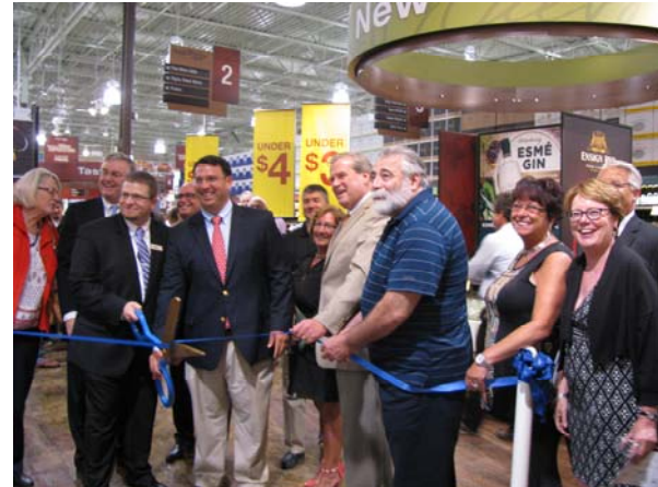
Ribbon-cutting at Total Wines & More in Milford. 10% of Beer and Wine Sales over the first 5 weekends will be donated to local charities, including the Milford Fine Arts, Council, the Connecticut Audubon Society Coastal Center and the Arts Council of Greater New Haven.