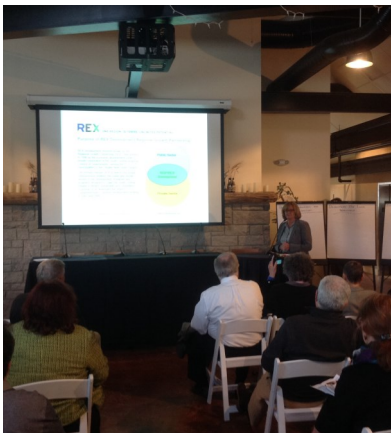
Shoreline Economic Development Summit