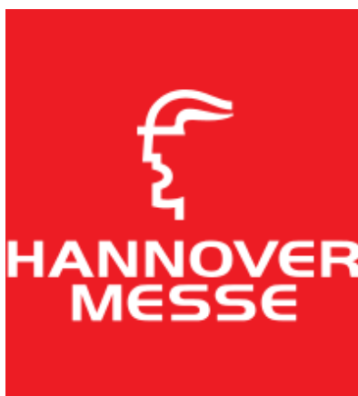
Hannover Messe Manufacturing Tradeshow