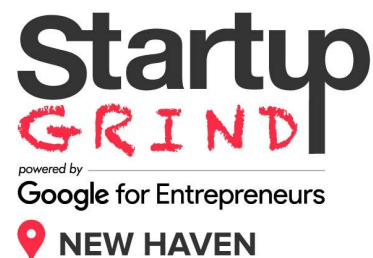
5/19 with Matt Powers of Uber